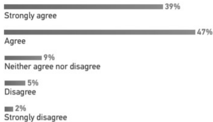
Fig. 1. Diagram respondents' answers to the statement: «By 2025, AR/VR/MR/XR will be as ubiquitous as mobile devices in the consumer market»