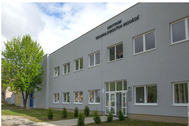
Fig. 2. Premises of the Technology Innovation Centre PK10 with offices reserved for some of the start-up companies operating within TUKE Startup Centre

TUKE Startup Centre was established in 2014 to promote entrepreneurial activities at academic ground as a result of the Technical University of Košice initiative. TUKE Startup Centre is an organizational structure, developed in the University Centre of Innovation, Technology Transfer and Intellectual Property Protection (UCITT) with regional scope. Its mission also meets one of the objectives of the University Science Park TECHNICOM.