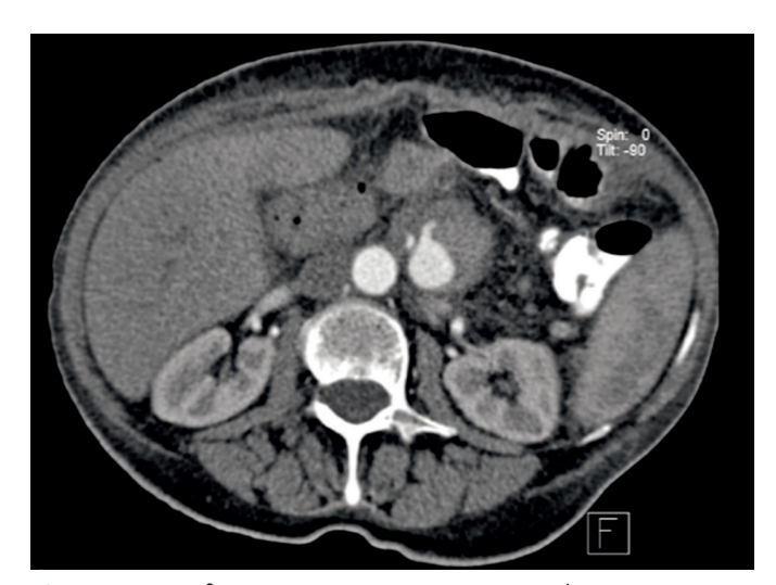
Fig. 5. CT scan of superior mesenteric artery pseudoaneurysm

With the implementation of diagnostic methods such as angiography and CT angiography into clinical practice, visceral artery aneurysms and pseudoaneurysms can be detected before their complications develop that, certainly, increases the quality of treatment thereby reducing the risk of postoperative complications (8, 13).