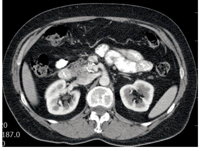
Fig. 2 CT angiography scan of superior mesenteric artery pseudoaneurysm with a diameter of 25 × 20 mm.