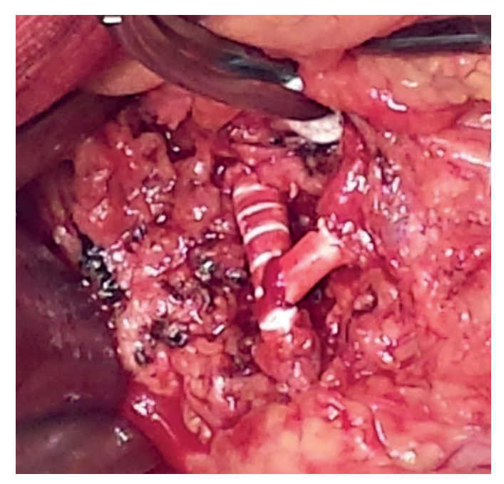
Fig. 4 Arterial reconstruction of the celiac artery with a PTFE Graft.