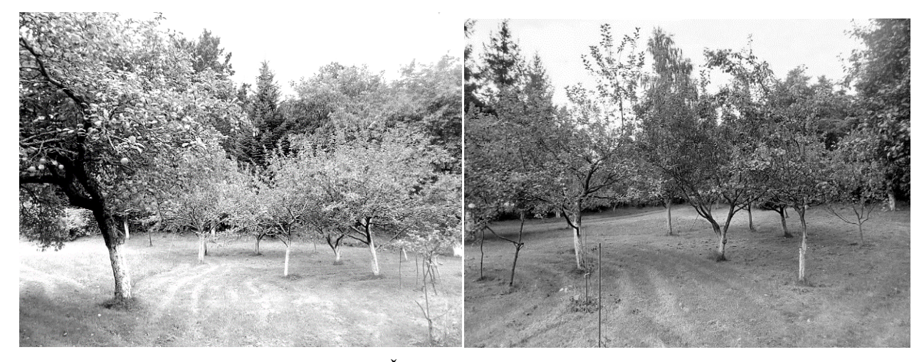
Fig. 1. Monitored apple orchard in the Vyšná Šebastová village, Eastern Slovakia

White sticky traps were exposed in the 2021, at the apple orchard within the private garden in the Vyšná Šebastová village, Eastern Slovakia, GPS: 49° 0' 36.7377883" N, 21° 19' 52.3414707" E, 372 m altitudes above sea level, mildly warm and humid climatic region, with slightly skeleton pseudogley soils, of middle slope and north exposition. Orchard consists of the apple trees of various ages, height and variety (Fig. 1), surrounded by the gardens and arable land shelterbelt of mixed tree species.