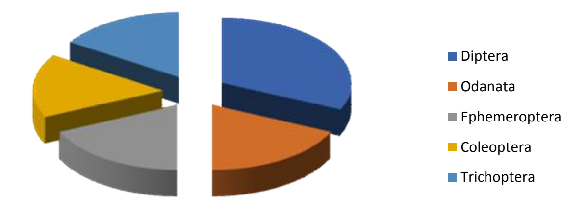
Fig. 3. Distribution of macrobenthos by groups

Cloeon dipterum. Ecdvonurus venosus, Heptagenia sulfurea, Calopteryx virgo, Ischnura elegant, Ophiogomphus cecilia, Somatochlora metallica, Ilybius fuliginosus, Berosus spinosis, Hydropsyche ornatula, Hydropsyche pellucidula, Potamophylax rotundipennis, Eusimulium znoikoi, Odagmia variegata, Odagmia caucasica, Simulium kurenseschachbusicum, Ablabes myiamonilis, Clinotanypus newosus, Cricotopus silvestris, Cricotopus biformis, Eukiefferella sellata, Diames ainsignipes and other species that belong to Reophile environmental group predominate because of their detection frequency (P > 50%).