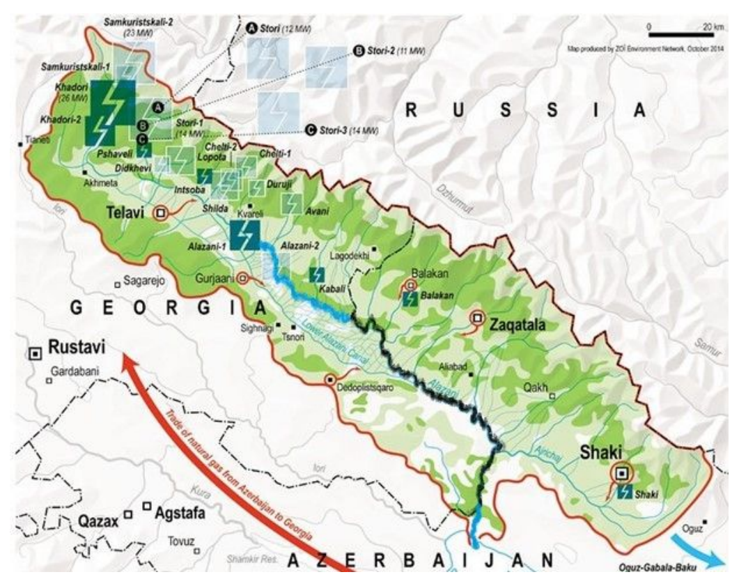
Fig. 1. Map-scheme of Alazani (Ganikh) River basin

Geographical coordinates: Starting point: 42°25'18''N, 45°14'04''E. The point of junction to Mingachevir reservoir: 41°00'24''N, 46°38'25''E.