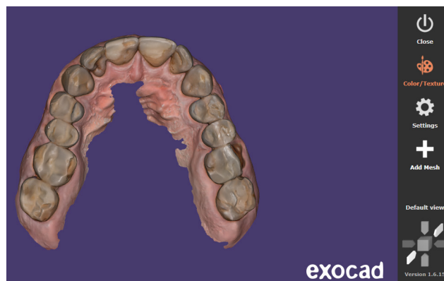
Fig. 1. Interface of Exocad webview for the analysis of intraoral scans

Exocad view (exocad GmbH, Darmstadt, Germany) was used as an application to view intraoral scans of the patients. It may be used either in the form of cell-phone application, or online via web-browser ( https://webview.dental/ ) (fig. 1).