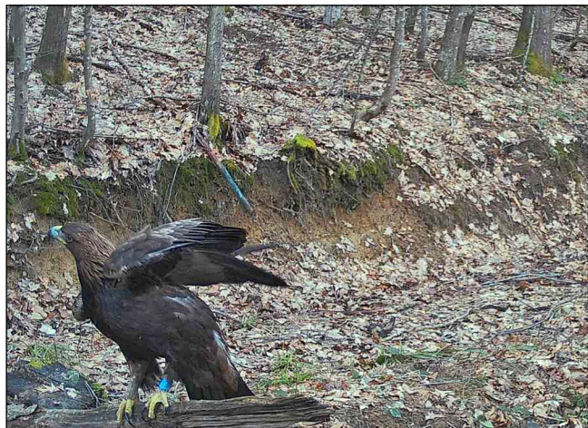
Golden Eagle photographed by a camera trap, 18.02.2024. Беркут, сфотографований фотопасткою.